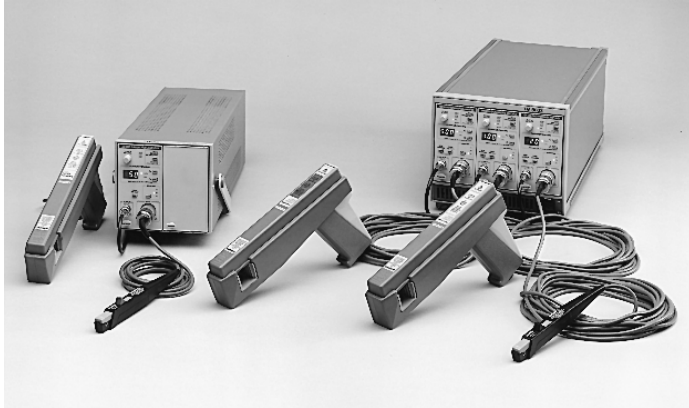
AM503 Current Measurement Family