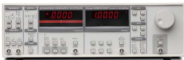
SR810 DSP Single Phase Lock-In Amplifier