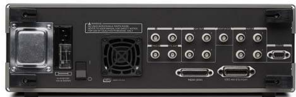
SR810/830 rear panel