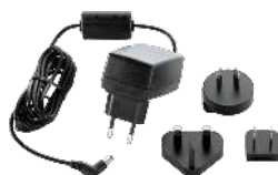
52110056 Mains adapter