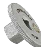
11030010 Square drive adapter