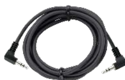
52110051 Jack cable