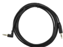
52110052 Spiral cable