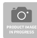
52100059 Transducer in case