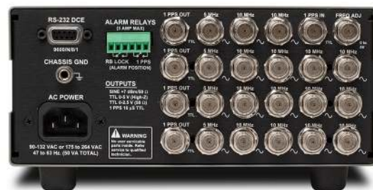
FS725 rear panel (with Opt. 03)