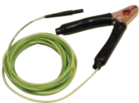
2003-724 Ground lead (1 each)

5 Tap ( X1, X2, X3, X4, X5) Test Leads, 20ft (6.096m)