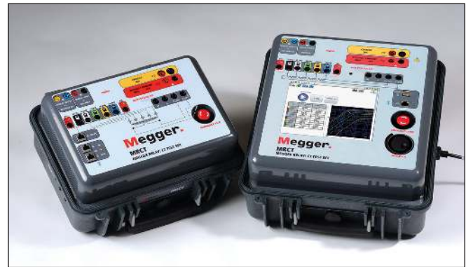
The MRCT is available in 2 onboard display/enclosure options.

■ Industry leading test duration using patented simultaneous multi tap measurements - The MRCT system can provide concurrent measurement of voltages on all taps during CT saturation, and ratio and polarity testing. This allows the MRCT system to calculate the knee points and ratios of all windings at the same time thus eliminating the need for multiple tests on a CT. This will drastically reduce testing time.