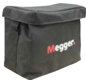
2003-725 Accessory Carry Case (1 each)

Accessories included in standard set of test leads.