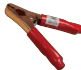
640266 Large test clip (1 each)