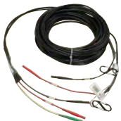
1005-466 Set of primary test leads (1 each)

Use to carry power cord, Ethernet cable, Optional STVI and test leads.