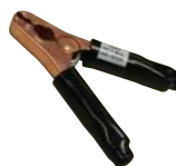
640267 Large test clip (1 each)