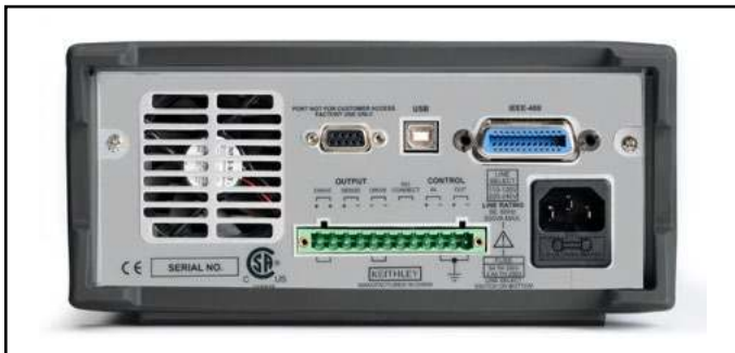
Series 2200 rear panel.