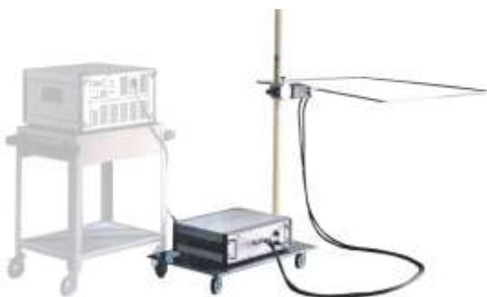
MAG 100 current transformer, 1mx1m antenna mounted on support stand (right) shown with the power source (left)

The MAG 100 can be used for both vertical and horizontal plane testing, by simply rotating the coil antenna in its mounting on the (optional) stand. The MAG 100 can only be used for continuous mode testing.