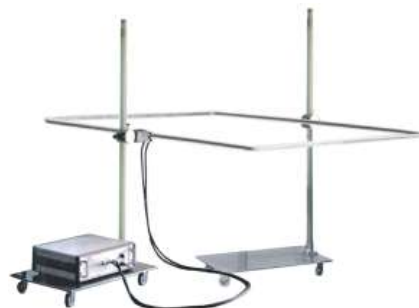
MAG 100 current transformer, 2mx2.6m antenna mounted on two support stands

All EN product standards and many other applications.