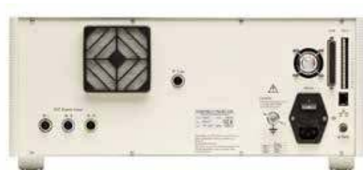
AXOS 5 rear view