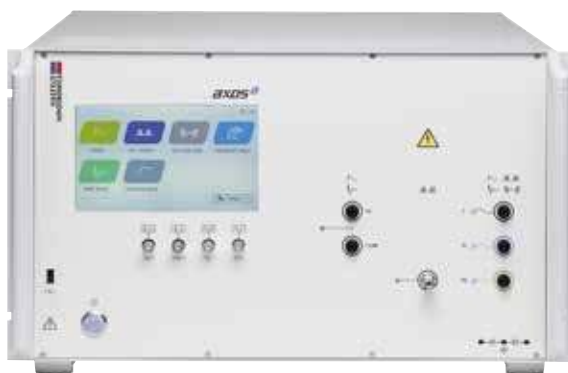
AXOS 8 front view

A wide range of cost-efficient and user friendly coupling / decoupling networks for power lines as well as for symmetrical and asymmetrical data- and signal lines are available as options.