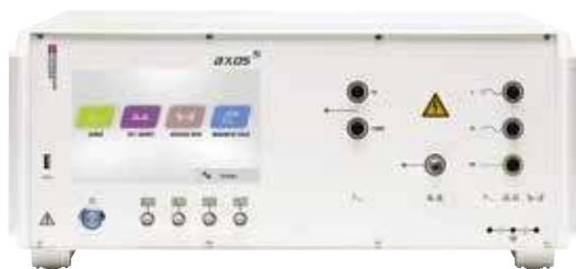
AXOS 5 front view

A wide range of cost-efficient and user friendly coupling / decoupling networks for power lines as well as for symmetrical and asymmetrical data- and signal lines are available as options.