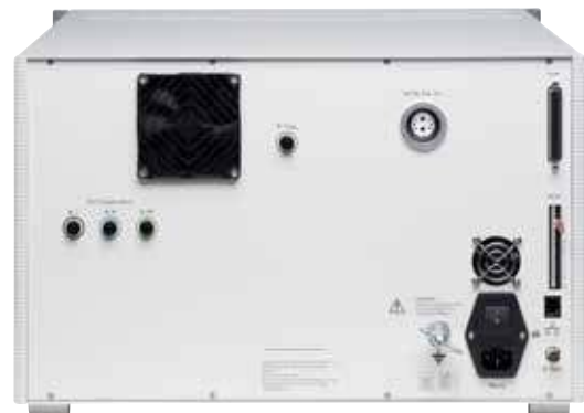
AXOS 8 rear view