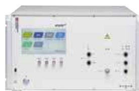
AXOS 8 EFT/Burst Test System Article no. 2490830

Surge 1.2/50 \mu s...8/20 \mu s IEC/EN 61000-4-5