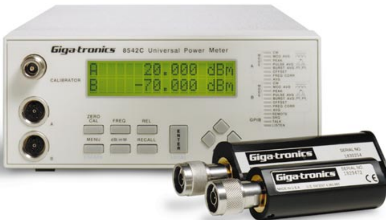
The Giga-tronics 8540C Series combines the speed, range, and capabilities needed to test today's sophisticated communications systems.

The exclusive Time Gating feature of the 8540C lets you program a measurement start time and duration to measure the average power during a specific time slot of a burst signal. This is critical for accurately measuring the average power of GSM, NADC and