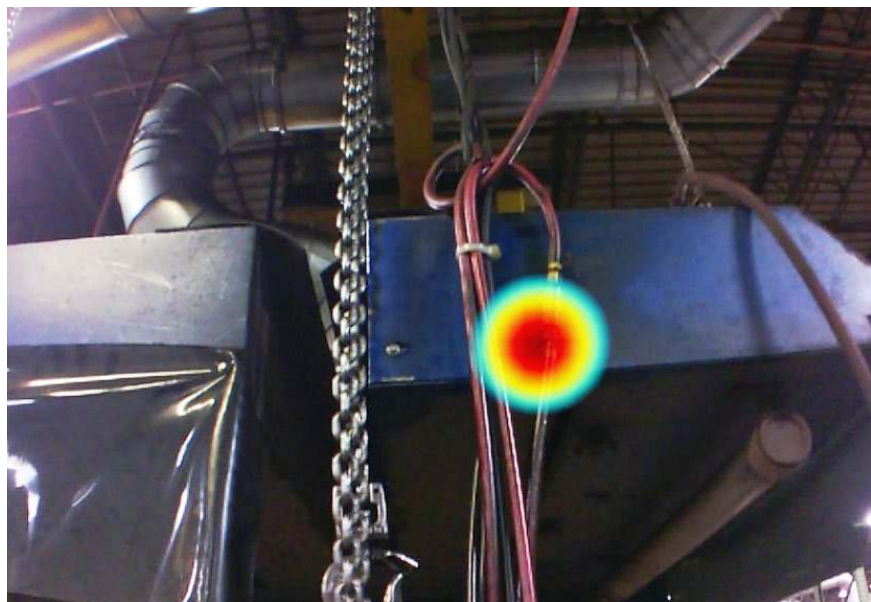
Images taken with the ii900 Sonic Industrial Imager in an industrial environment.

Fluke. Keeping your world up and running.®