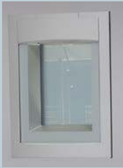
8 & 14 cu. ft.: 9" x 10.3" window 32 cu. ft.: 17" x 10" window