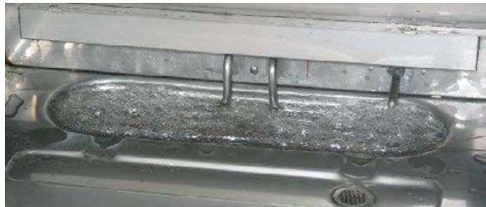
A humidity bath heats water right in the chamber for faster response, and is easier to maintain than traditional steam generators.