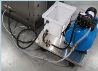
System has a recirculation mode and holds 5 gallons