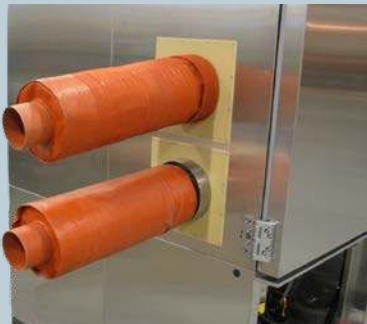
14 & 32 cu. ft. models can be modified to supply conditioned air to a remote chamber