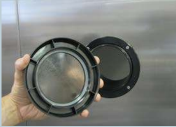
2", 4", or 6" diameters available