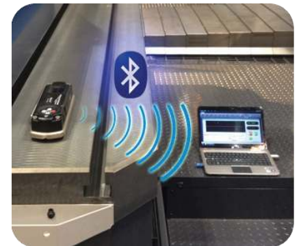
Digi-Pas ® 2-Axis levelling Utilizing Advanced Digital MEMS Technology