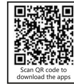
Scan QR code to download the apps