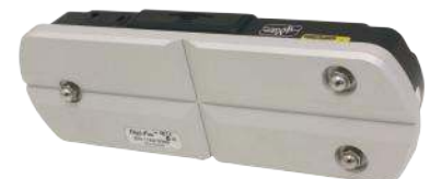
3-Points Contact Base

These instrument/device are temperature calibrated for the entire specified operating temperature range.