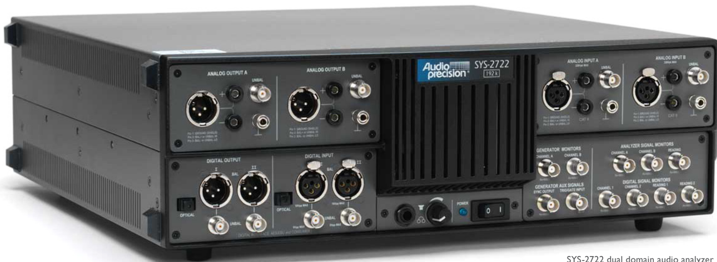
SYS-2722 dual domain audio analyzer

The highest performance audio analyzers in the world