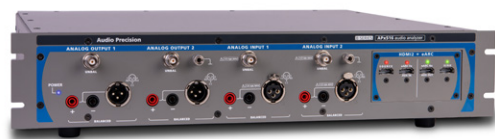
APx516B with HDMI2+eARC digital audio module

The APx516B uses the same APx500 measurement software that is used on all other APx series analyzers and includes features like input signal monitors and file analysis. While the APx516B comes with a set of out-of-the-box measurements, you can maximize the value and functionality of the measurement software with subscription licenses.