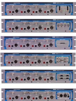
APx516B Digital Module Options